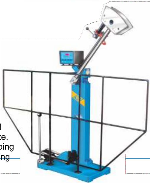
Model: IT-30 (D)